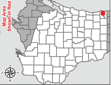
Map Area Shown in Red