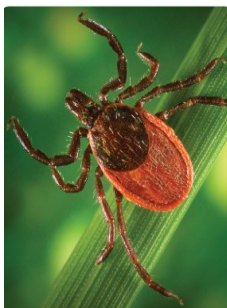
Watch for a circular reddish rash which could indicate Lyme disease.